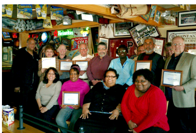
AARP and IRS volunteers enjoy a Thank You Luncheon hosted by the United Way of Hudson County.

In April, the United Way, in partnership with the IRS and AARP, provided free tax return preparations